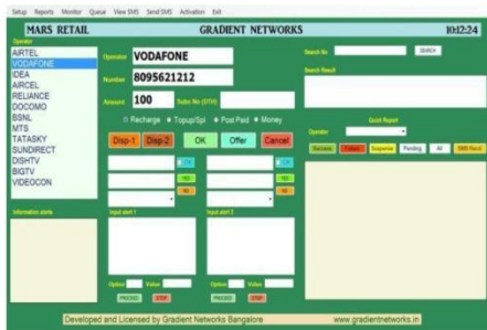
Windows Desktop Application