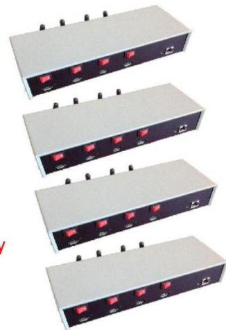
GSM Modems 4-16 ports